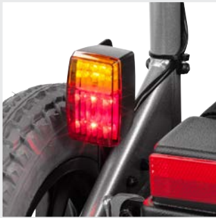
Long-life LED light optionally available