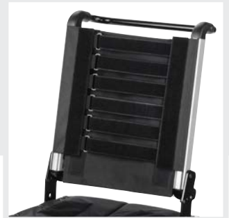
Adjustable seat and back