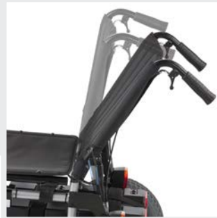
30° backrest adjustment optionally available