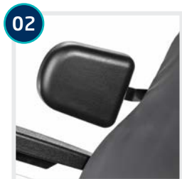
Article 1080610/ 1080612