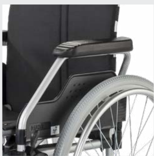
Side guard can be conveniently removed