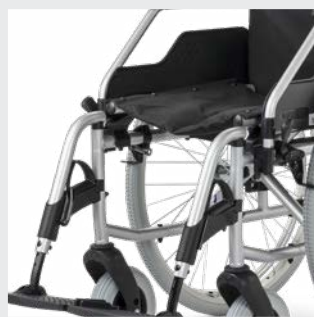
Seat height variable at the front