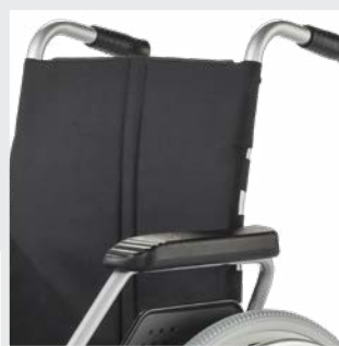
Adjustable back strap