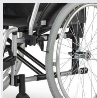
Double cross offers more stability