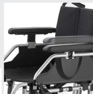
Height-adjustable side guard with depth-adjustable arm supports in series