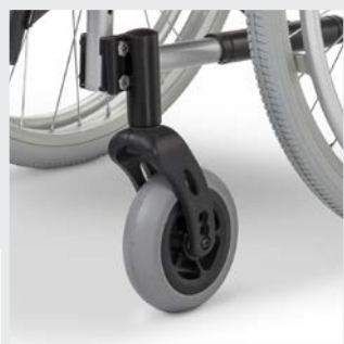
Angle of steering head is adjustable