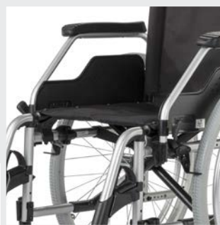
Modifications are quick and precise