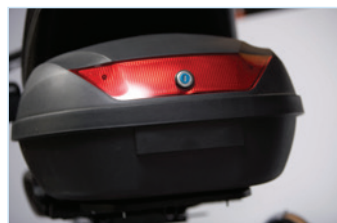
Optional rear pannier box

We have a continuous product improvement policy and consequently reserve the right to amend design and specification without prior notice. All sizes and weights stated are nominal. All errors and omissions excepted. Due to the limitations of photography and the printing process colours shown may not be 100% accurate.* Depends on user mass, terrain and battery condition.