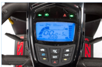
Digital LED Display

If you would like to view this product please contact your local stockist, details below.