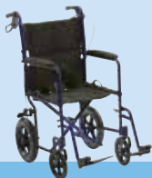
Aluminium Travel Chair Plus