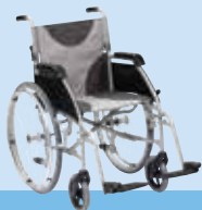
Ultra Lightweight Aluminium