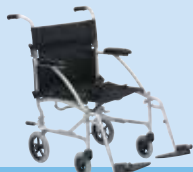
Travel Chair in a Bag