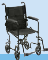
Aluminium Travel Chair