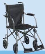
Travelite Transport Chair