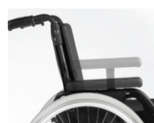
Height Adjustable arm rests